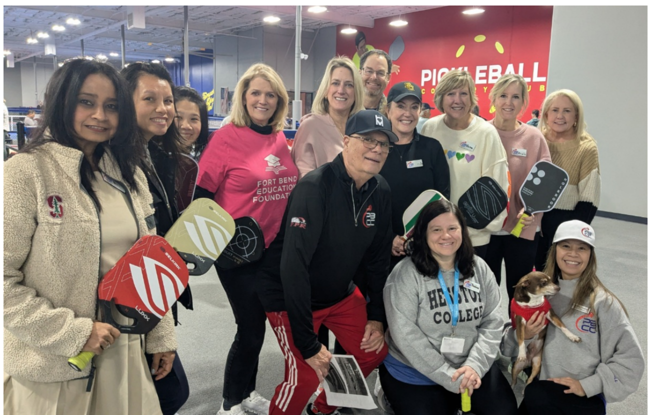
Our 2025 FBEF Pickleball Tournament Committee is gearing up for the inaugural event!

Registration for the pickleball tournament opens soon. For more details and to learn about sponsorship opportunities, go to <a href="https://bit.ly/2025fbefpickleball">https://bit.ly/2025fbefpickleball</a>.